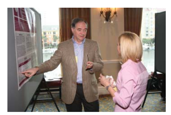
Developmental Methodology Poster Session

SRCD is pleased to issue a call for additional <u>proposals for 2014</u> for which members are encouraged to submit their ideas. The due date for proposals was April 1<sup>st</sup>; decisions will be made June 1<sup>st</sup>. We look forward to future stimulating meetings that focus on one topic that is of interest to members and others in the field.