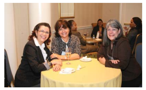
Reception at the Positive Development of Minority Children Meeting